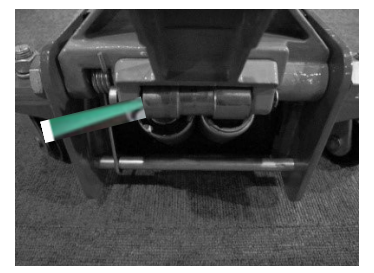
Roller Pin (left)