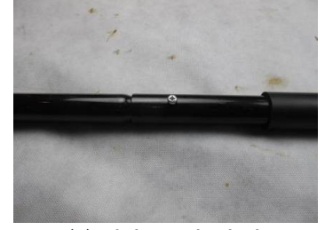
(2) Unscrew the bolt from the handle